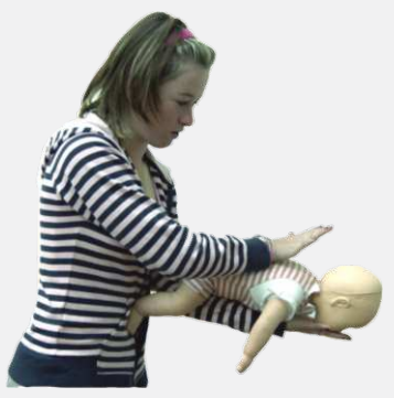
This is one method for infant- if having to act quickly where no seat is available to allow for positioning over the first aiders thigh.

Infant: Back blows - head downwards so gravity will assist with expulsion. Across your lap/thigh or over your arm. Chest thrusts – turn over.